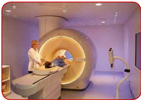
Diagnostikas klīnika ARS ARS FILIALE

The new branch of „Medicīnas sabiedrība ARS” – „ARS Diagnostikas klīnika” focuses on the diagnostics of early breast cancer, gastric-intestinal tract cancer diagnostics, nephrolith treatment by means of lithotripsy. The outpatient institution is the only one in the Baltic States equipped with 3 Tesla magnetic resonance device Philips Ingenia 3.0T. Besides the conventional examinations, it is also equipped with oncology and cardiology software, and the body screening function: within a single examination it performs full diagnostics of the thorax, abdomen, pelvis, brain, spine, and muscles and bones. The screening results are analysed by 3 radiologists.